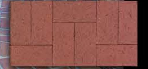
Brookstown Red 1 3/8" x 4" x 8" (Modular available)