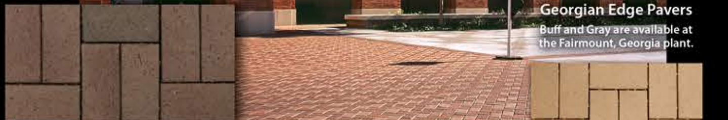
Georgian Edge Pavers

Buff and Gray are available at the Fairmount, Georgia plant.