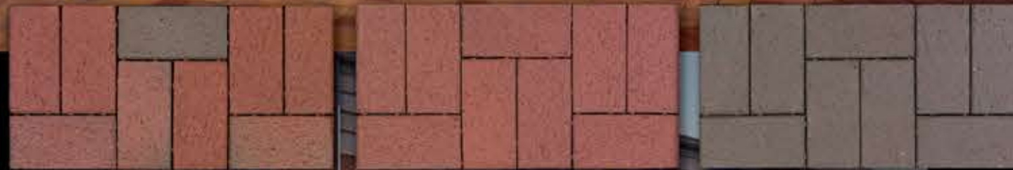
English Edge® FR

English Edge® Rose with Ironspot accents