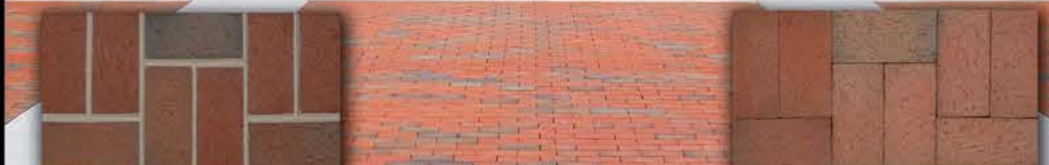
Pathway FR 2 1/4" Modular