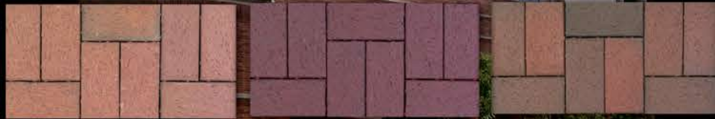
English Edge® Rose FR