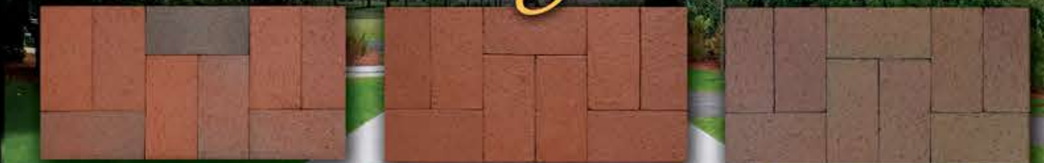
Pathway FR 2 1/4" x 4" x 8"