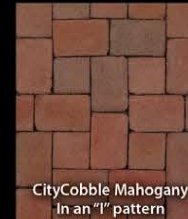
CityCobble Mahogany In an "I" pattern

CityCobble Rumbled® pavers offer a cobblestone look - the most popular look in segmental paving today. This 2 1/4" thick product includes two sizes, a 5 1/3" square and a 5 1/3" x 8" rectangle. When they are installed in an "I" or modified herringbone pattern, they give a random cobble look reminiscent of ancient walkways laid in stone.