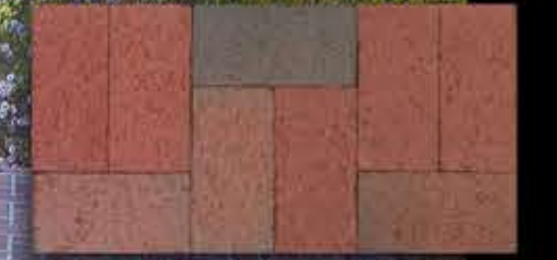
Brookstown FR 1 3/8" x 4" x 8" (Modular available)