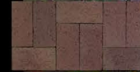
Harbourtown FR 1 3/8" x 4" x 8" (Modular available)