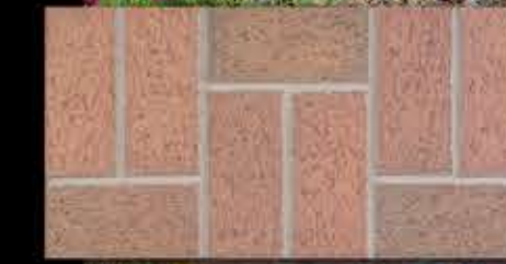
Carytown FR 1 3/8" Modular